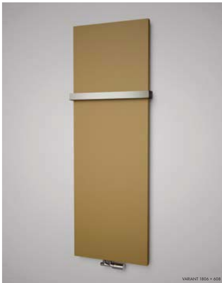
VARIANT 1806 × 608