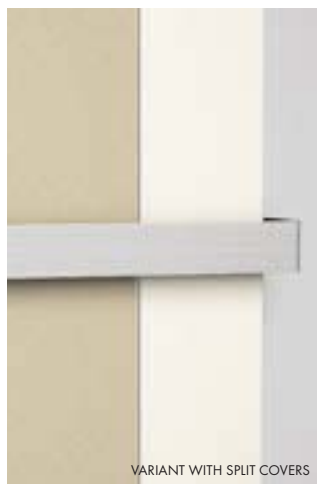
VARIANT WITH SPLIT COVERS